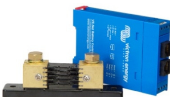
VE.Net Battery Controller

No prescaler needed. Note: RJ45 connectors are galvanically isolated from Controller and shunt.