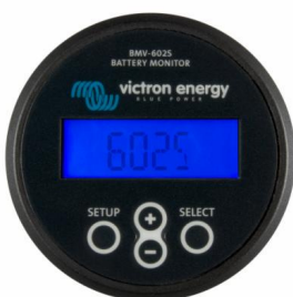
BMV 602S Black