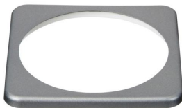
BMV bezel square